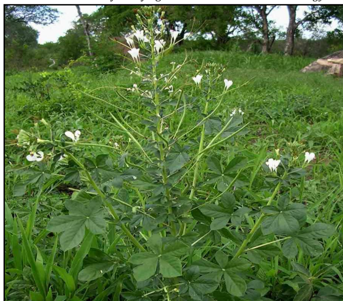
Fig. 1: Morphological View of Cleome gynandra